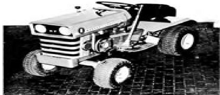
MF 8 LAWN TRACTOR AND MOWER