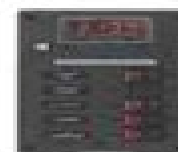
Blue Sea 3002 / 3003