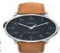
MY HUSBAND HAS & LOVES THESE