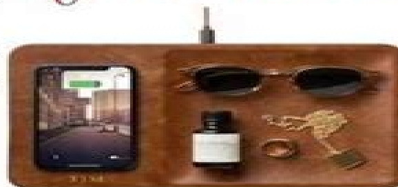
WIRELESS CHARGING TRAY