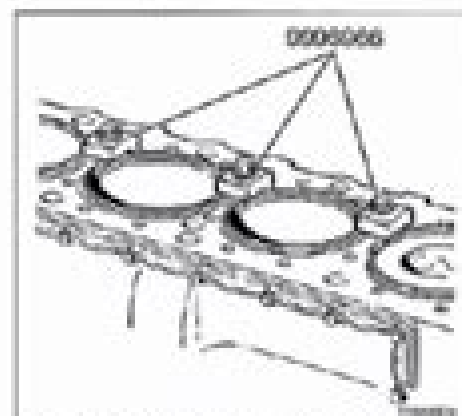
Figure 252 — Cylinder Liner Clamping Tools

The cylinder head must be installed and torque tightened within 20 minutes after the sealant has been applied.