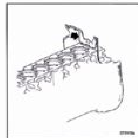
Figure 254 — Sealant Application Pattern — Head to Block

The cylinder head must be installed and torque tightened within 20 minutes after the sealant has been applied.