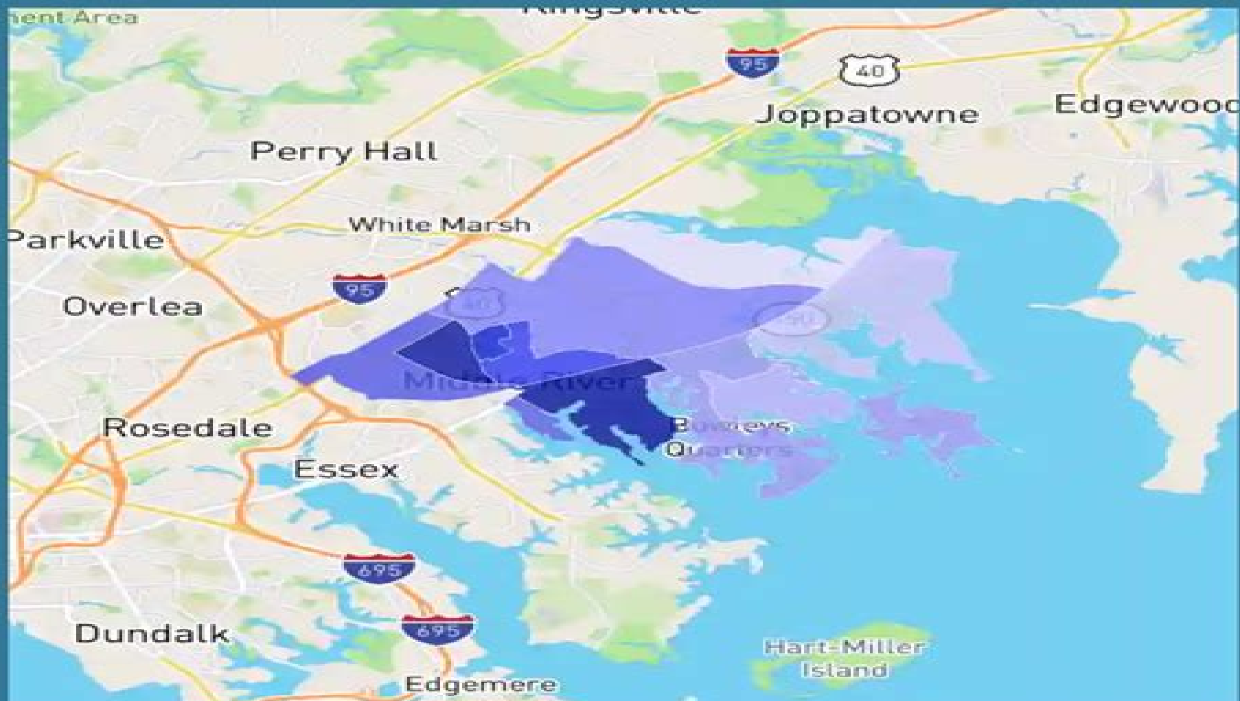
Middle River, MD Crime Map By Neighborhood