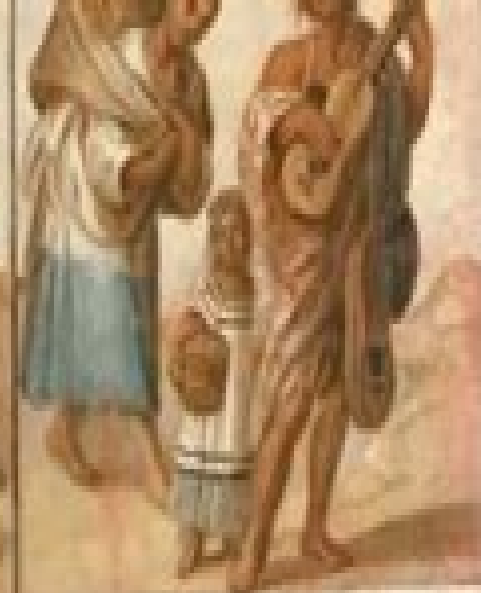
Canhuco con India. Sambigo.