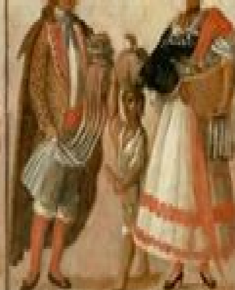
Gibaro con Mulata Albarazada