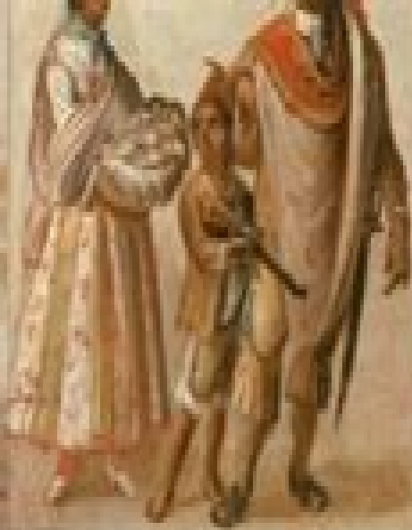
Lobo con China Gibaro.