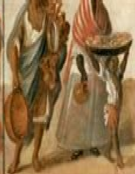
Albarazada con Negra Canhuco.