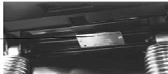
Vehicle Identification Serial Number