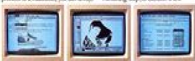
Keywords: experimentally induced stress Keywords: productivity Keywords: supplies for research

Thanks to its size, if you can't bring the problem to a Macintosh, you can always