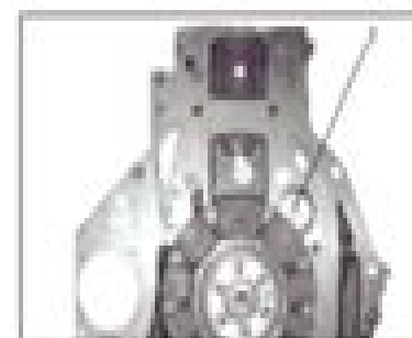
Fig. 7 1. Cover

Lubricate valve tappets and camshaft with engine oil and install into the crankcase.