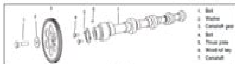
Fig. 4 Camshaft Assembly

b) Check the fit of the idler gear and shaft to specifications.