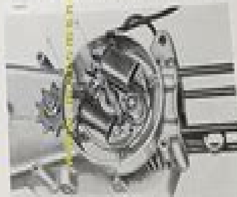
Fig. 3 - Remove the pump from the motor using the 1/2 inch pin and the 1/2 inch pin.