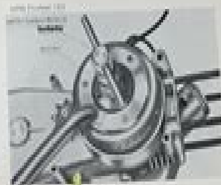
Fig. 2 - Remove the pump from the motor using the 1/2 inch pin and the 1/2 inch pin. The pump is shown in the motor and the 1/2 inch pin is shown in the pump.