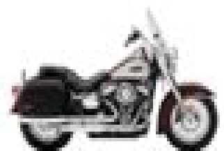
HERITAGE GLIDE® FL 114