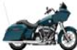
ROAD GLIDE® SPECIAL FL 114