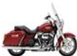
ROAD KING® FL 114