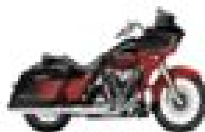
CVO® ROAD GLIDE® FL 114