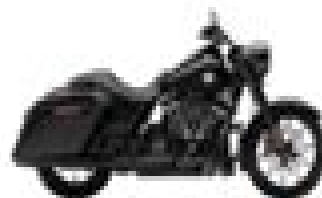
ROAD KING® SPECIAL FL 114