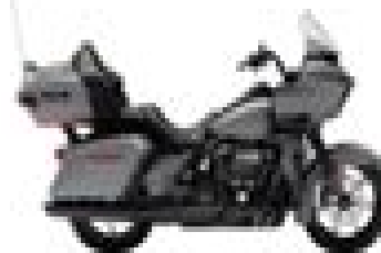
ROAD GLIDE® LIMITED FL 114