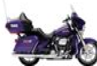
ULTRA LIMITED FL 114