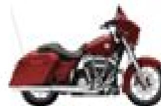
STREET GLIDE® SPECIAL FL 114