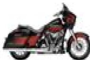
CVO® STREET GLIDE® FL 114