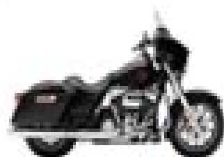
STREET GLIDE® STANDARD FL 114