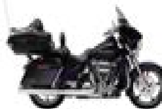
CVO® LIMITED FL 114

©2020 Harley-Davidson, Inc. All rights reserved. Harley-Davidson is a registered trademark of Harley-Davidson, Inc. All other trademarks are the property of their respective owners.