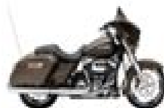
STREET GLIDE® FL 114