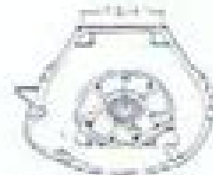
Ford 1A, 429, 460, 251-6, 428R