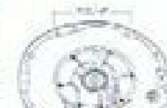
Chrysler TH-727 & 904, 373, 318, 340, 360