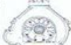
Ford 1A, 209, 302, 351C, 351W