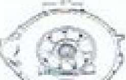
Ford C4, 302, 352, 360, 390, 400, 471, 478