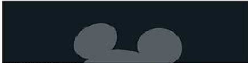
PANTONE Black 6