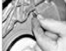
15.13 Fit the screws back into position