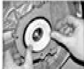
15.12 ... and using a drift to keep it square, tap it into the cover

seems with the oil seal housing is to fit that position.