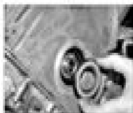
15.11 Fit the seat and into the cover