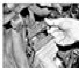
4.17 Disconnect the spring connection from the ECM

See Illustrations: Plug the ends of the pipes to prevent dirt ingress.