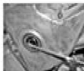
15.1a Doing a checkover to look out the seat