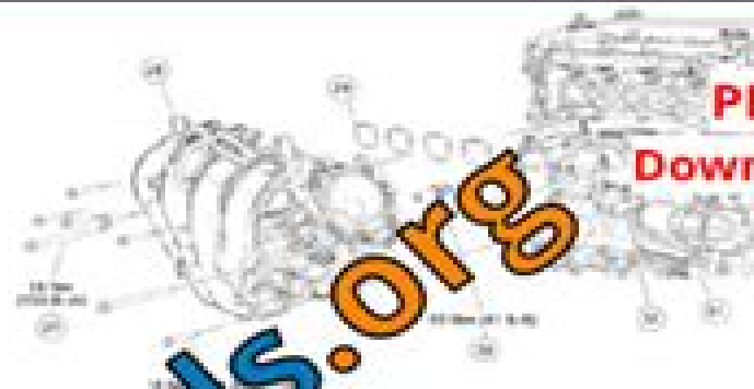
Fig. 4: Identifying Tightening Sequence Of Lower Intake Manifold Bolts Courtesy of FORD MOTOR CO.