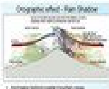
1. Tropical Deserts: Tropical Deserts