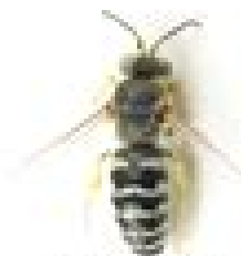
American sand wasp (2.5 to 4 cm) Wave-like banding Bright yellow legs and greyish banding