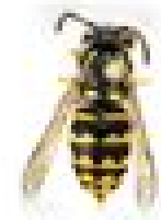
Northern aerial yellowjacket (1 to 2 cm) Bright yellow legs, brighter banding