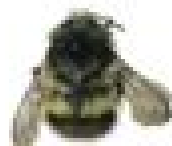
Bumble bees (0.5 to 1.5 cm) Fuzzy and stout