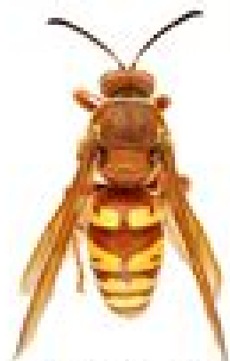
Cicada killer (3 to 5 cm) Irregular banding Smaller head/body ratio