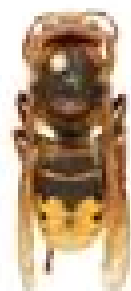
European hornet (2.5 to 4 cm) Dotted banding