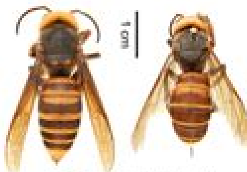
Asian giant hornet (3 to 5 cm) Mostly uniform orange and brown banding Orange head, dark brown body