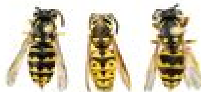
Yellowjackets (1 to 2 cm) Various species, smaller than hornets More brightly marked around wing shoulders