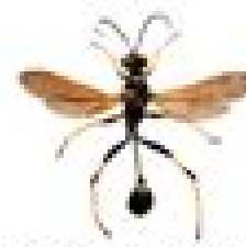
Mud-daubers (2 to 3 cm) Petiole connecting abdomen and thorax is long and thin