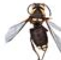
Bald-faced hornet (1 to 2 cm) Mostly black and white