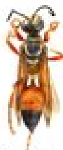
Golden digger wasp (1.5 to 2.5 cm) No banding thin and narrow "waist"