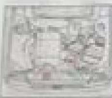
1. Vista de la suspensión de la parte delantera. 2. Vista de la suspensión de la parte trasera.