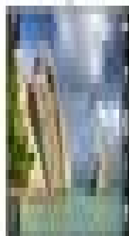
... ... ... ... ...

1. The first step is to identify the problem. This involves understanding the current situation and what needs to be changed.