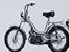
Fig. 1. Moto Guzzi 1951

SPICCE (motociclista a 2 ruote con motore a tutto per la manutenzione ordinaria e straordinaria)