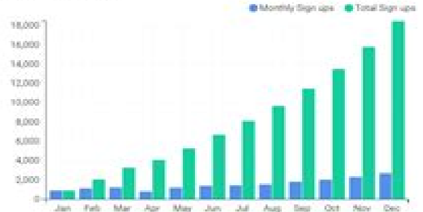
Monthly Sign Ups