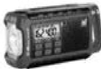
Emergency Crank Radios