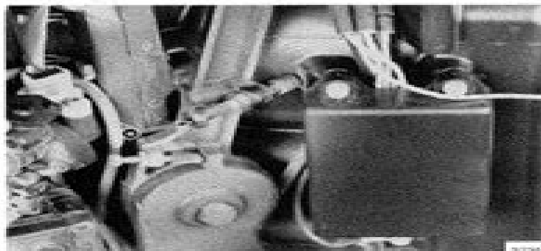
a - Maximum Spark Advance Screw