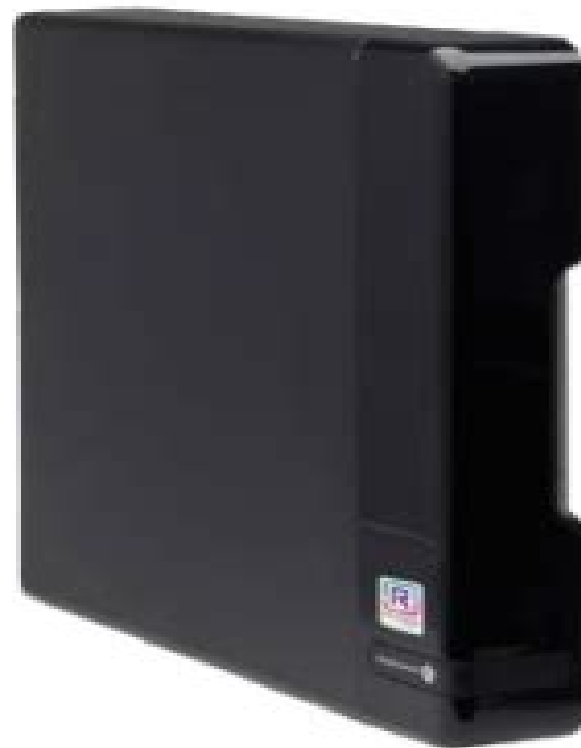
OXO Connect C25