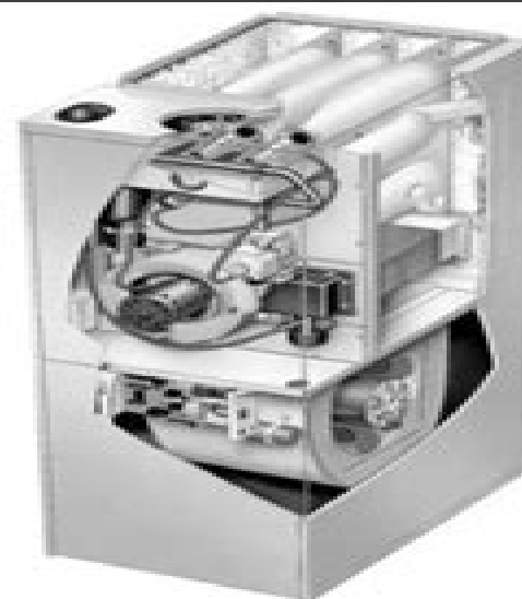
G26 FURNACE ▲ G26 HEAT EXCHANGE ASSEMBLY

Information contained in this manual is intended for use by qualified service technicians only. All specifications are subject to change. Procedures outlined in this manual are presented as a recommendation only and do not supersede or replace local or state codes. In the absence of local or state codes, the guidelines and procedures outlined in this manual (except where noted) are recommended only.