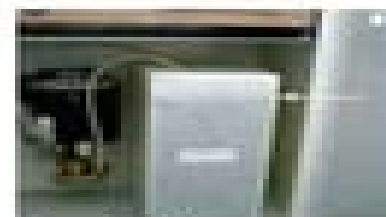
Figure 1-4 Spindle cooler reservoir.