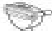
Figure 10-15 Main neutral connection to the ground bus