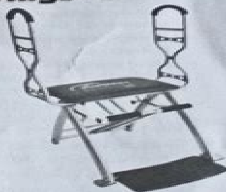
Malibu Pilates® Chair and Sculpting Handles