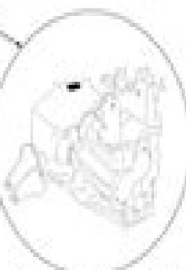
Manual transaxle number