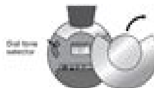
Jabra GN9250r/ Jabra GN9250c