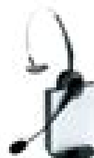
Jabra GN9120 EHS/ Jabra GN9125 EHS