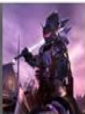
Knockout Knight Armour