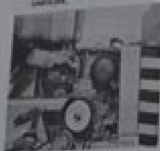
Fig. 13 - Oil Drain Plug

NOTE: Do not use fuel oil, No. 2, if the tractor is to be used in areas where it is not recommended.