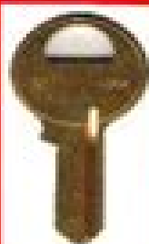
Master Lock M1