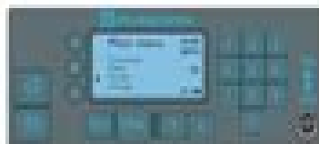
Image: Battery status - low

Charging with battery power. The mower starts with battery power. When the battery is low, the mower starts charging. When the battery is low, the mower starts charging. When the battery is low, the mower starts charging.