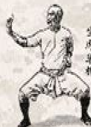
Deing Kiu "Nailing Bridge"