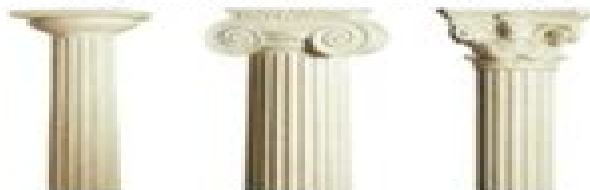
Doric Ionic Corinthian Types of Greek Columns

***The architects of ancient Greece used columns and arches in the construction of their buildings. Ancient examples still exist today: