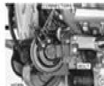
Fig. 10-10-10-2 Insert the special tool into the tensioner body.

Remove the cam chain tensioner after test and timing marker.