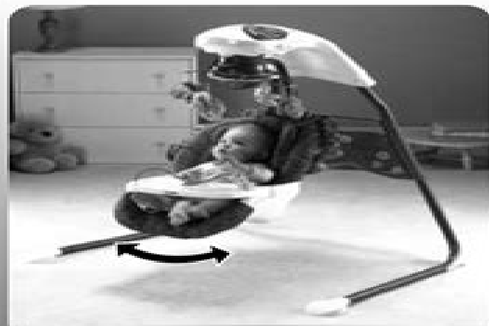
Cradle (Seat moves side to side)