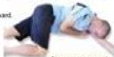
Adverse management impact priority injured injury