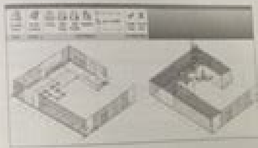
Figure 17-46 The Create Form button.