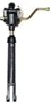
1884342R Levelling Box Assembly