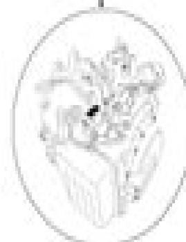
Manual transaxle number