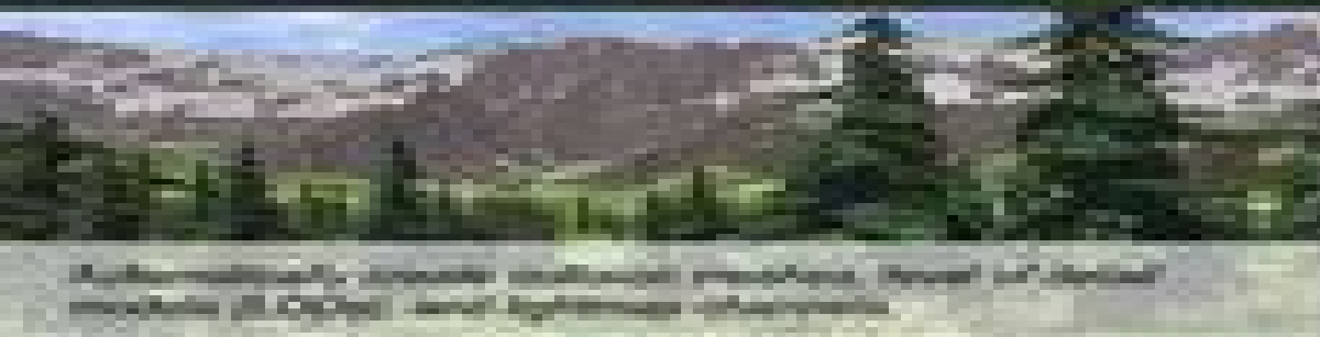
Automatic generation of a massive variety of plants and trees automatically including conifers and palms