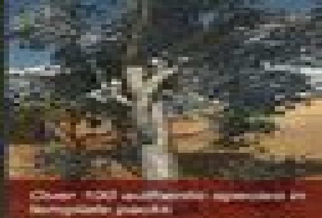
Close-up of a small, white, cross-shaped object in a tree trunk