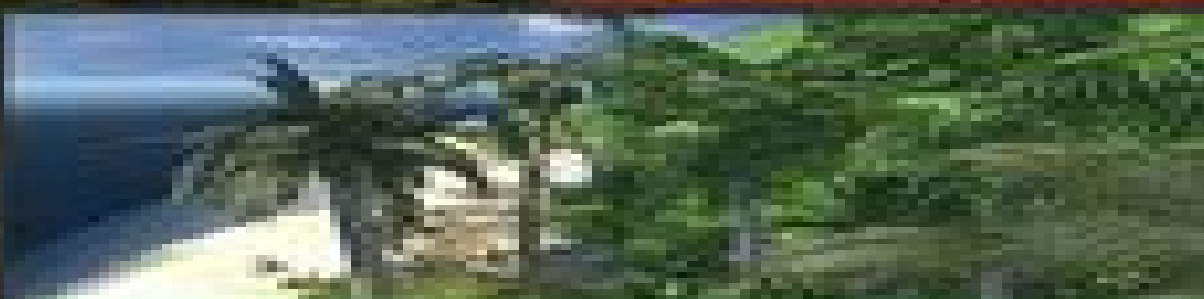
Close-up of a large, dark, abstract shape in a green landscape