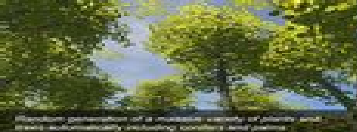
Automatic generation of a massive variety of plants and trees automatically including conifers and palms