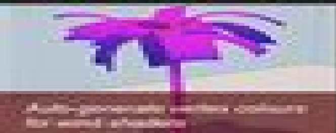
Auto-generated abstract colors for the world of plants