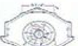
GM TH-400, 350, 250-48, 700R4, 3.80, 4.10, 4.62R Chevrolet