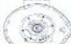
Chrysler TH-727, 341, 383, 400, 474, 440