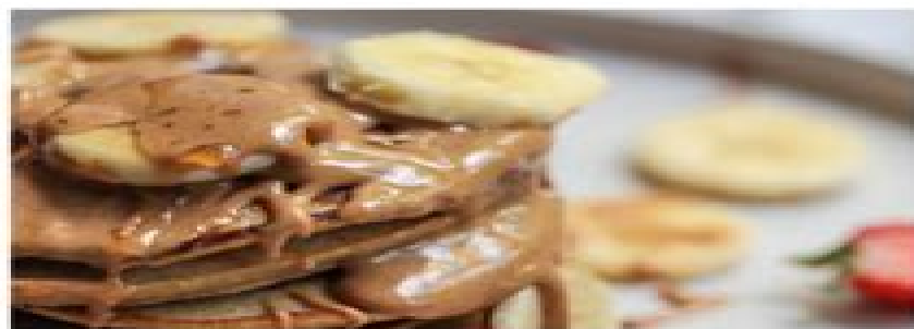
PROTEIN BANANA PANCAKES

479 CALORIES | 22 PROTEIN | 29 CARBS | 32 FATS | SERVES 1