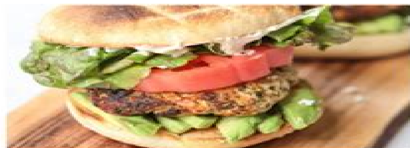
FETA & TURKEY BURGERS

490 CALORIES | 34 PROTEIN | 36 CARBS | 19 FATS | SERVES 4