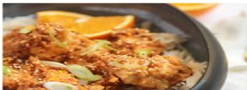
LIGHTER ORANGE CHICKEN

487 CALORIES | 33 PROTEIN | 41 CARBS | 25 FATS | SERVES 4