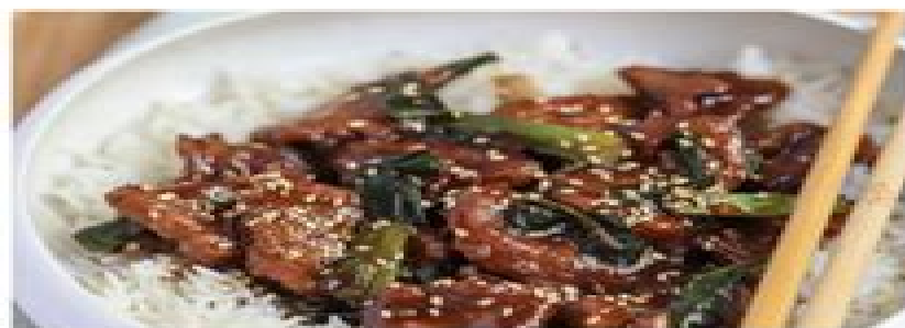
MONGOLIAN STIR FRIED BEEF

378 CALORIES | 32 PROTEIN | 38 CARBS | 16 FATS | SERVES 2