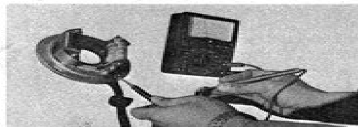
Fig. 8-5-2 Measure the resistance of pulser coil