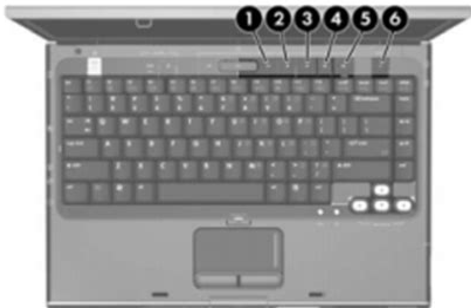
Top Components, Part 2, HP Pavilion dv1000