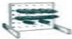
SEED CORN RACK