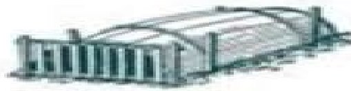
BARREL CHICKEN COOP