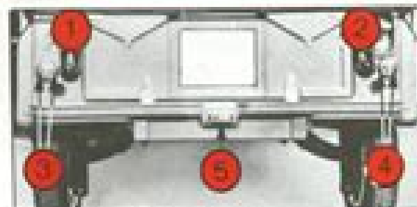
Fig. 45 - Luces de señalización traseras 1-2 - Luces de posición y stop 3-4 - Indicadores de dirección 5 - Alumbrado de matrícula